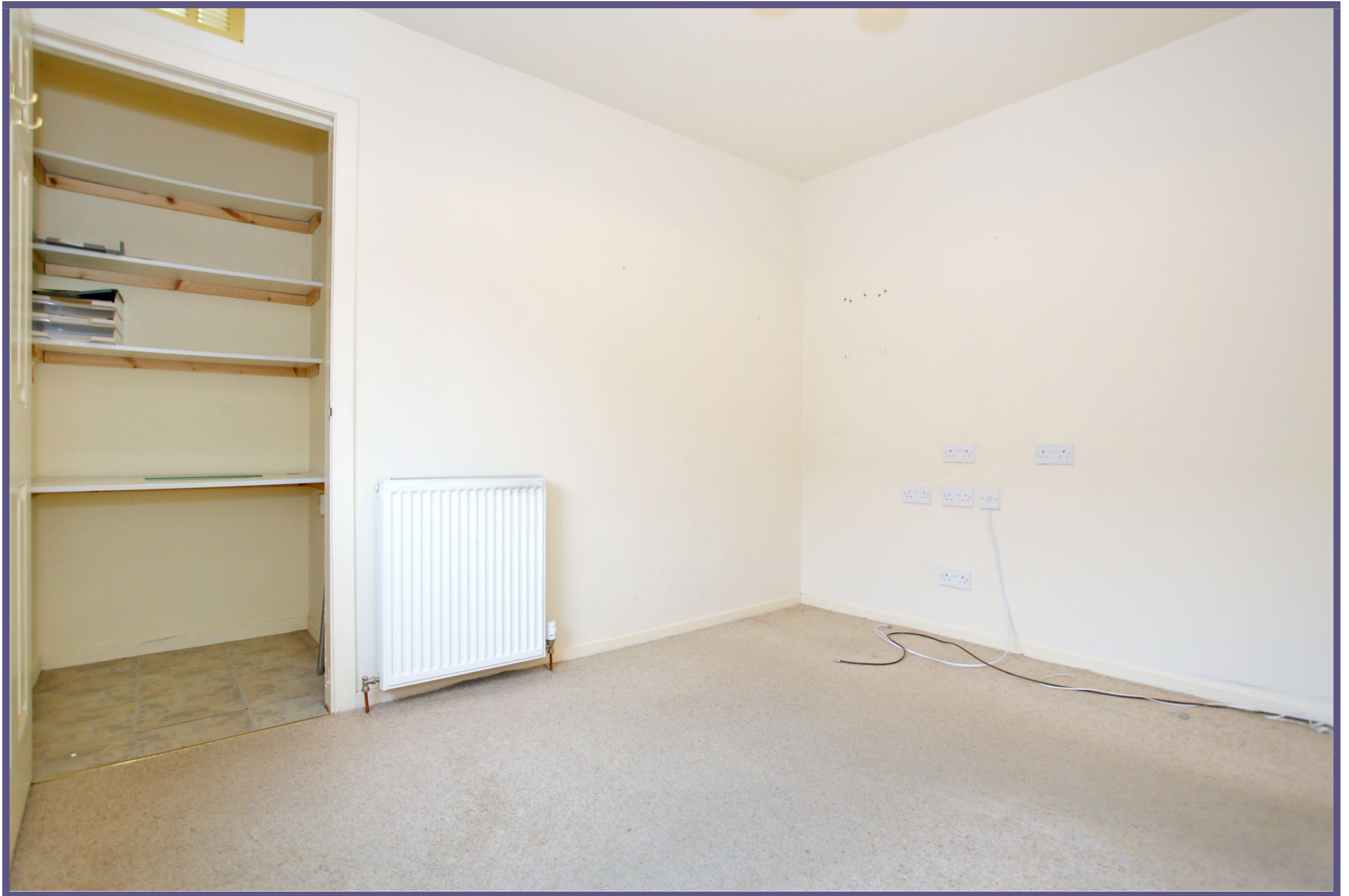
Double Bedroom 2