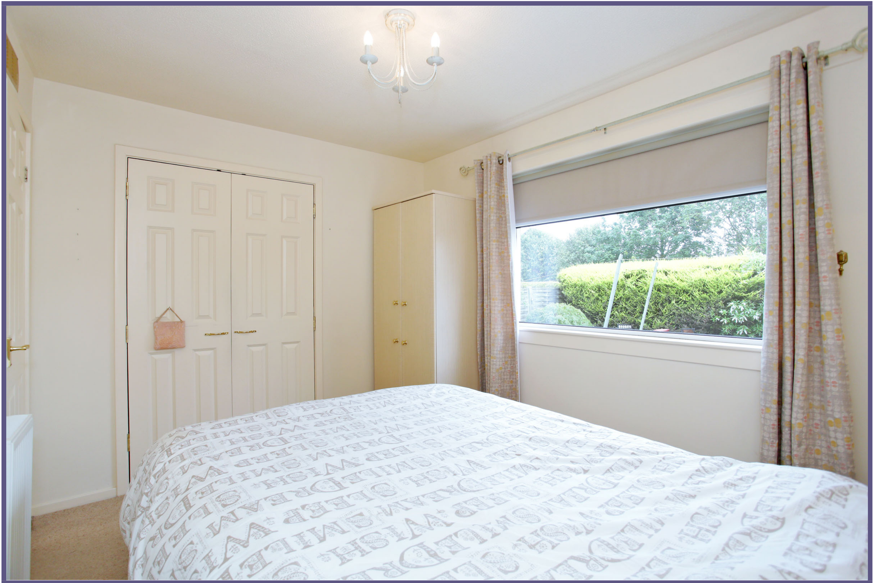
Double Bedroom 1