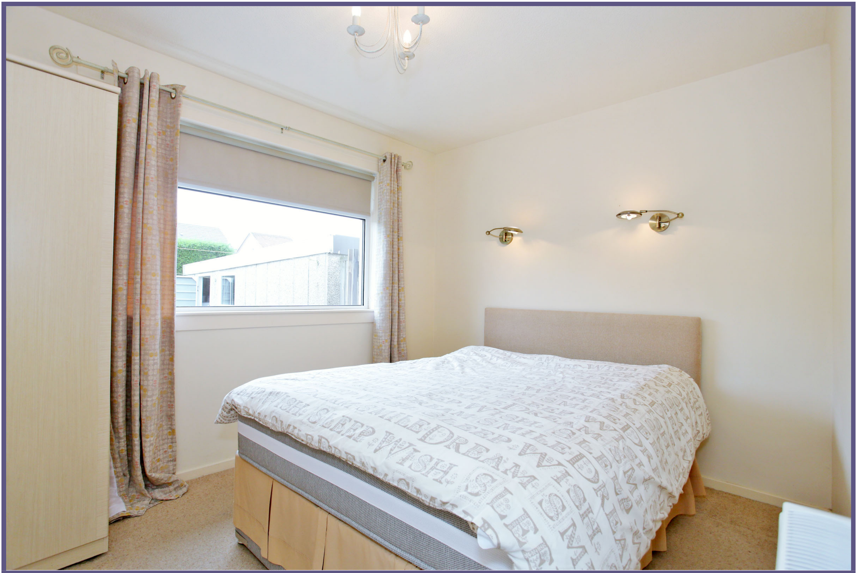
Double Bedroom 1